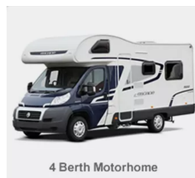
4 Berth Motorhome

DOES ANY TEAM HAVE TRAVEL CONTACTS – PERHAPS YOU COULD DONATE A TRAVEL GIFT VOUCHER TO GO WITH THE ABOVE 2 PRIZES???